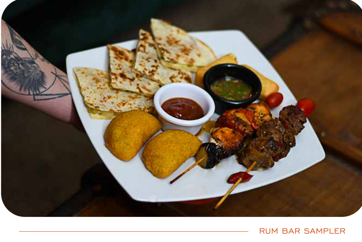
RUM BAR SAMPLER