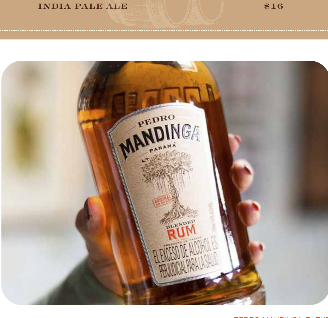
PEDRO MANDINGA BLEND