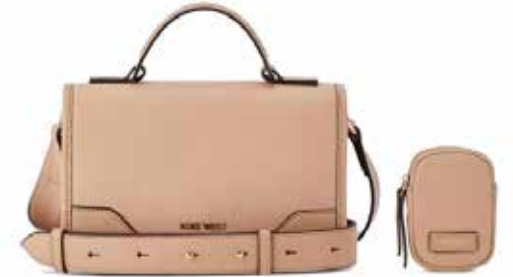
BROOKLYN CROSSBODY FLAP Gs.490.000 Gs.315.000