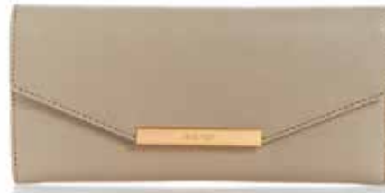
LANEY SLG CHECK SEC Gs.200.000 Gs.150.000