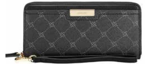
LAWSON ZIP Gs.290.000 Gs.175.000