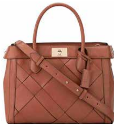
MAGDALENE ELITE SATCHEL