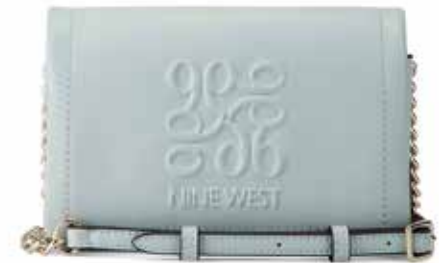
EMMALINE MINI CROSSBODY FLAP