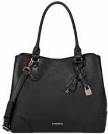
BROOKLYN ET SET CARRYALL Gs.590.000 Gs.375.000