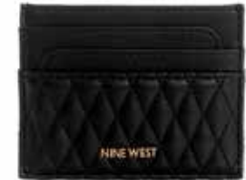
LINNETTE SLG CARD CASE