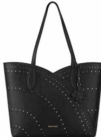
CHEYENNE JET SET TOTE Gs.580.000 Gs.375.000