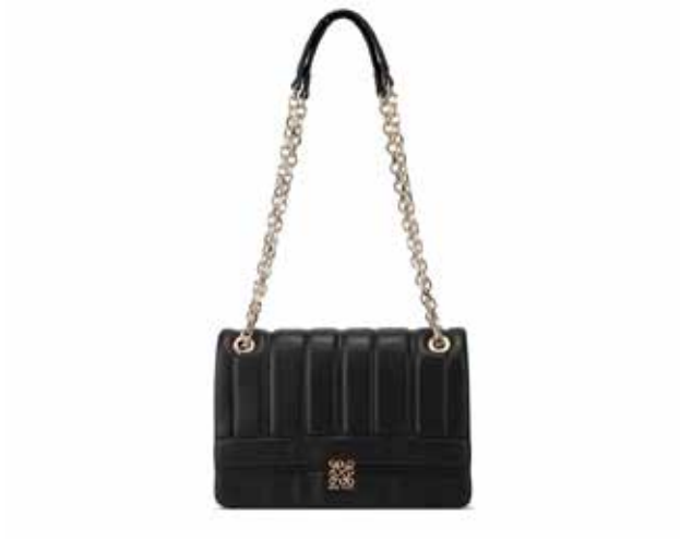
LELIANNA CROSSBODY FLAP