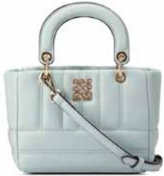
LELIANNA MINI SATCHEL