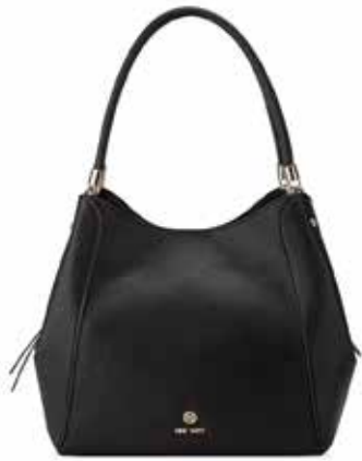
ETTA JET SET CARRYALL