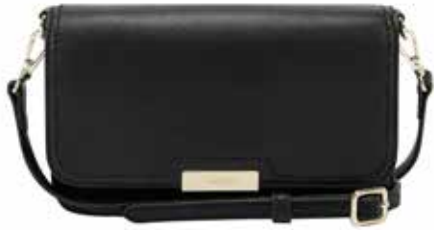
LAWSON WALLTER Gs.290.000 Gs.175.000