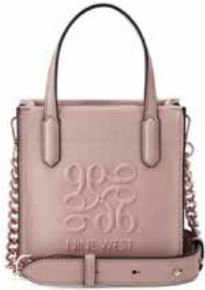
EMMALINE MINI TOTE Gs.450.000 Gs.295.000