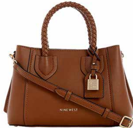
DINAH JET SET SATCHEL Gs.450.000 Gs.295.000