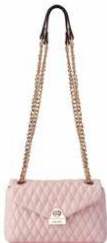
CAELIA MINI CNVRTBL XBODY FLAP