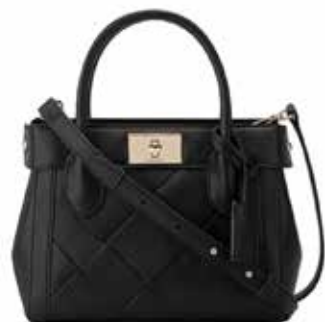
MAGDALENE SMALL SATCHEL