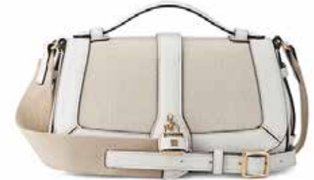
SHIRIN FLAP CROSSBODY