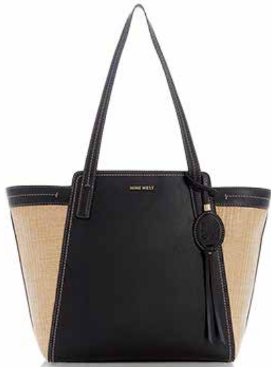
JENAE ELITE TOTE