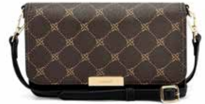
LAWSON WALLET Gs.290.000 Gs.200.000