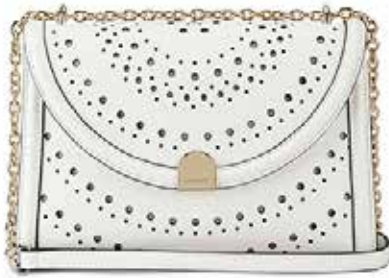
CHEYENNE CNVRTBLE XBODY FLAP Gs.550.000 Gs.350.000