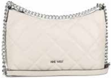
LOEW CONVERTIBLE SHOULDER