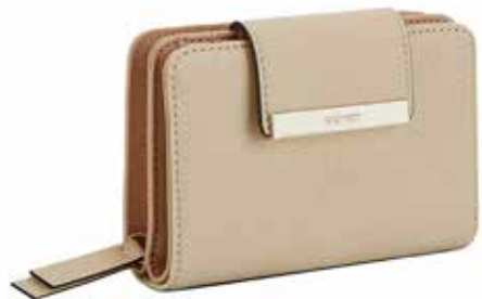
LANEY SLG FRENCH WALLET Gs.200.000 Gs.150.000