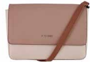
CALANDRA MINI FLAP CROSSBODY