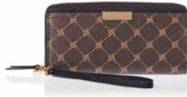
LAWSON ZIP Gs.290.000 Gs.200.000