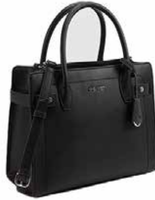
BETTINA SATCHEL Gs.490.000 Gs.315.000