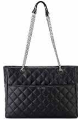
LOEW CONVERTIBLE CARRYALL