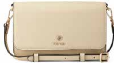
LINNETTE SLG WLLT ON A STRING