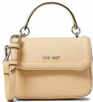
ANTONIETTA MINI FLAP CROSSBODY