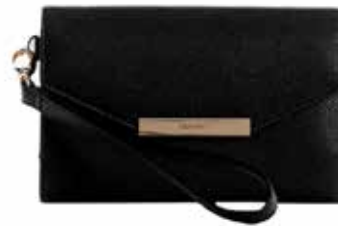
LANEY PHONE WRISTLET