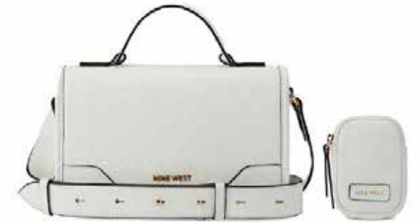
BROOKLYN CROSSBODY FLAP Gs.490.000 Gs.315.000