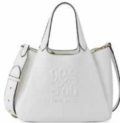
EMMALINE SMALL SHOPPER