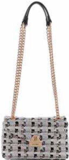
CAELIA MINI CNVRTBL XBODY FLAP Gs.480.000 Gs.315.000