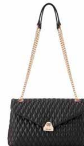
CAELIA CONVERTIBLE XBODY FLAP