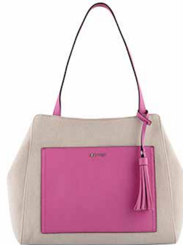
LANAH TRAP TOTE