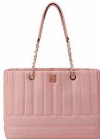
LELIANNA JET SET TOTE