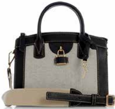
SHIRIN MINI SATCHEL