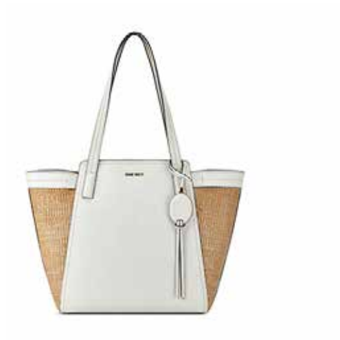
JENAE ELITE TOTE