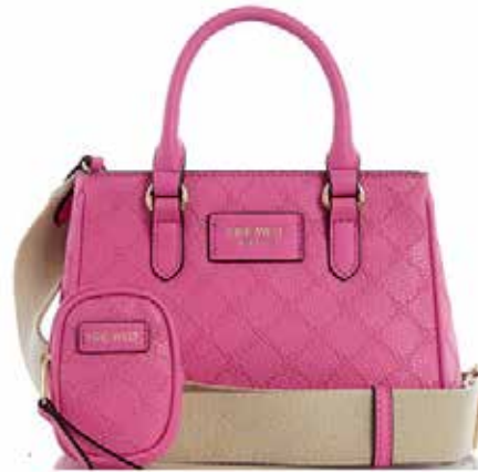
HOUGHTON MINI SATCHEL