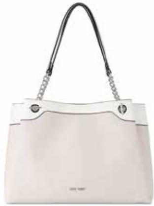
RAMI SHOULDER SATCHEL