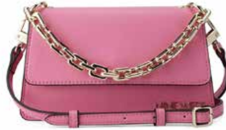
ANAÏS MINI CROSSBODY FLAP Gs.490.000 Gs.315.000