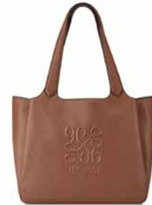
EMMALINE JET SET SHOPPER