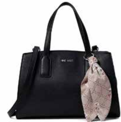
THERESE SATCHEL / BLACK