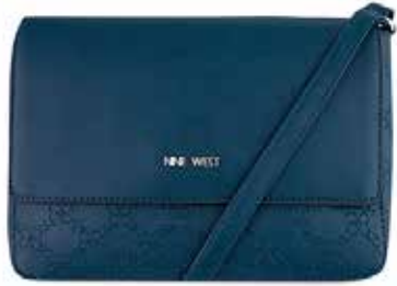
CALANDRA MINI FLAP CROSSBODY