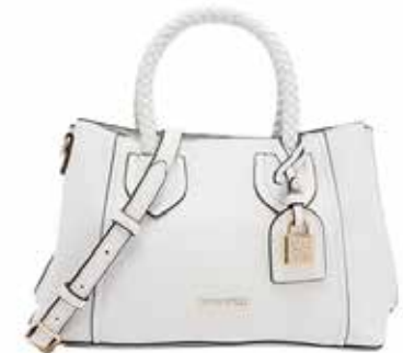
DINAH MINI JET SET SATCHEL Gs.390.000 Gs.250.000