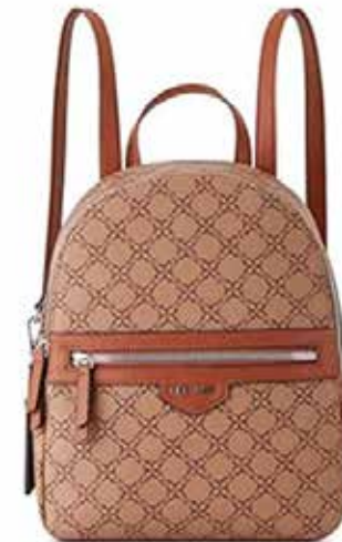
WHIDBEY MEDIUM BACKPACK