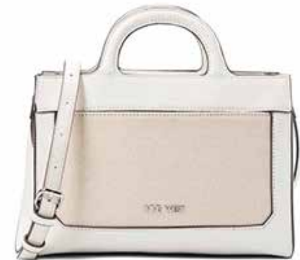
OJAI MINI CROSSBODY