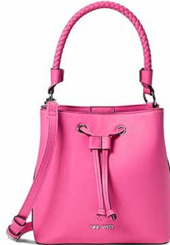
KALYPSO MINI BUCKET