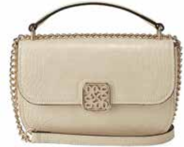
TAO XBODY FLAP Gs.490.000 Gs.315.000