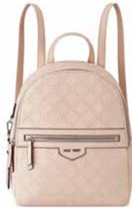
WHIDBEY MEDIUM BACKPACK