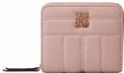
LELIANNA SLG SMALL ZIP AROUND